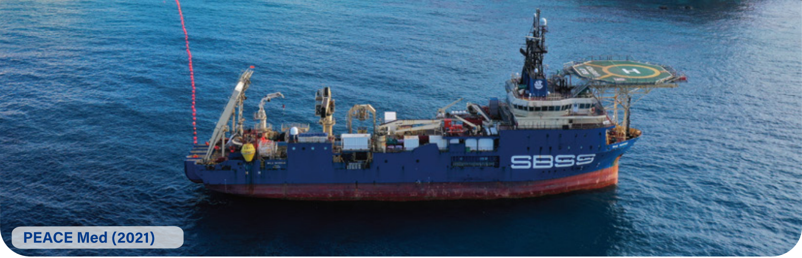
PEACE Med (2021)